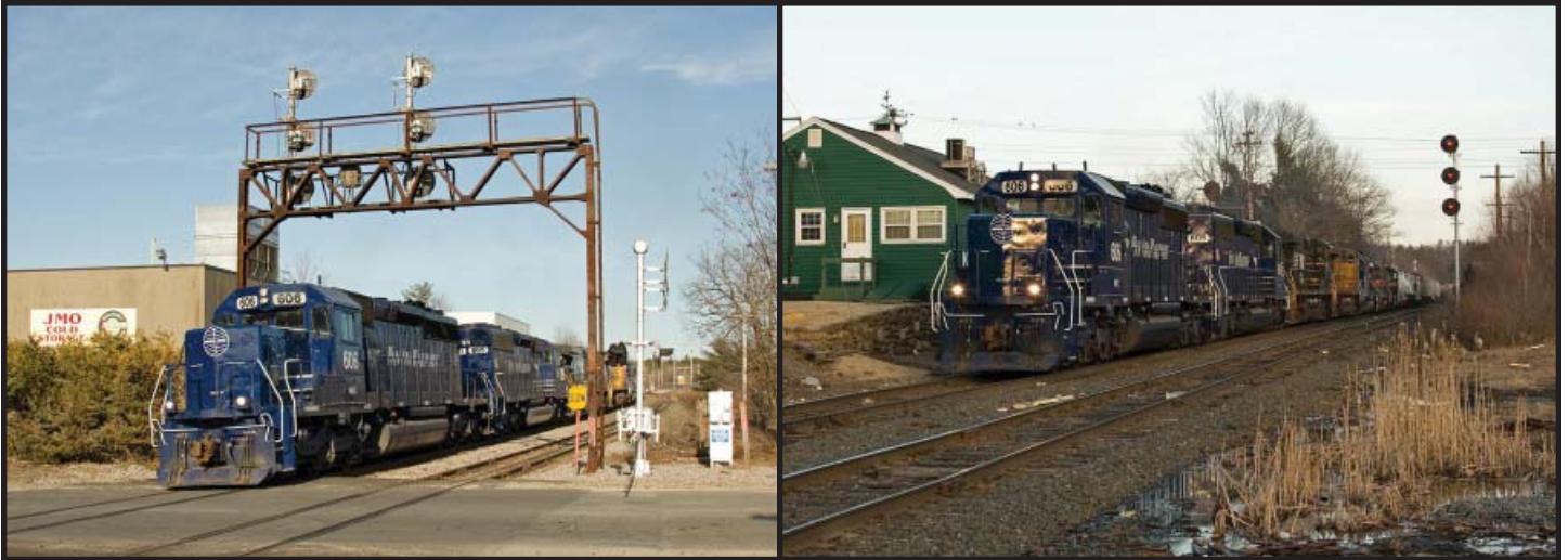
Views above of a Pam Am Railways, ex Guilford, ex B & M, freight as it moves through Lowell to Gardner, Massachusetts.