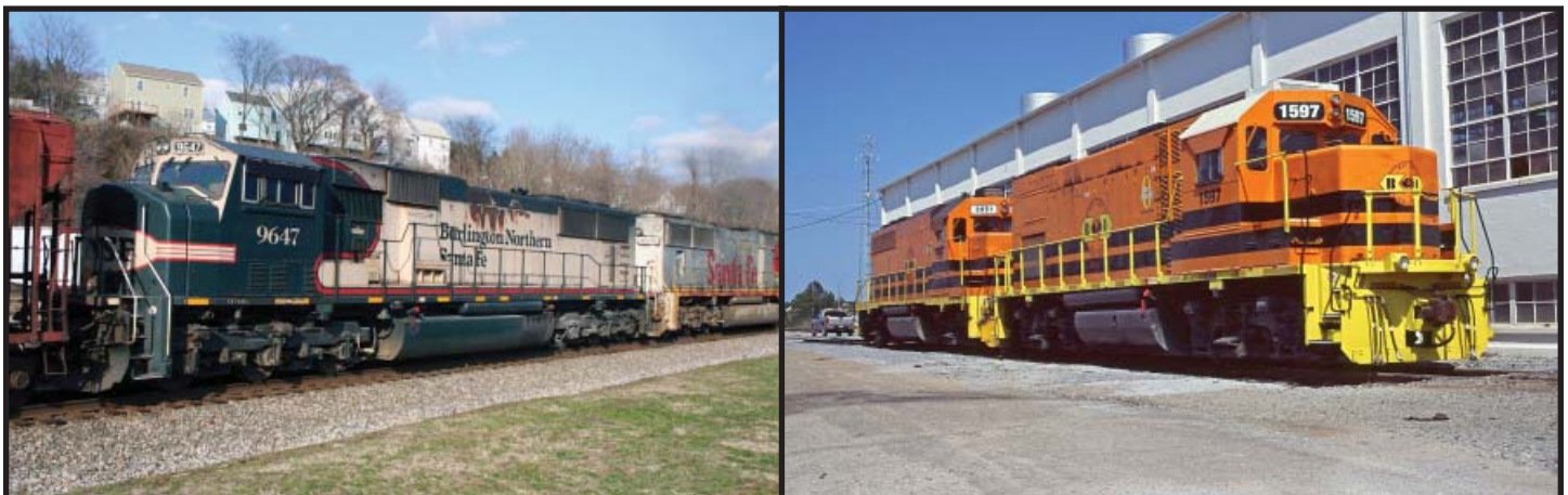
Left, the early BNSF paint scheme. Right, in Panama City, FL, the Genesee & Wyoming scheme for the Bay Line.