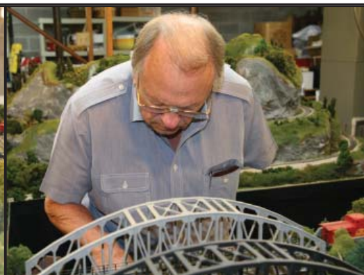
This is really small!!!