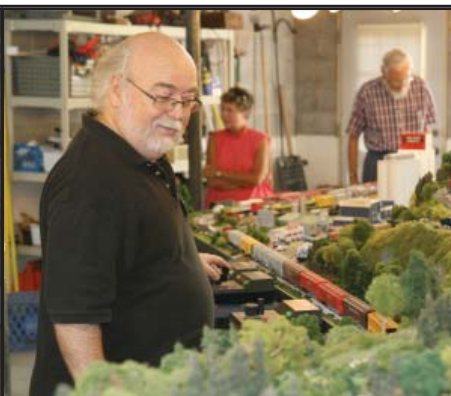
It's working great!!!