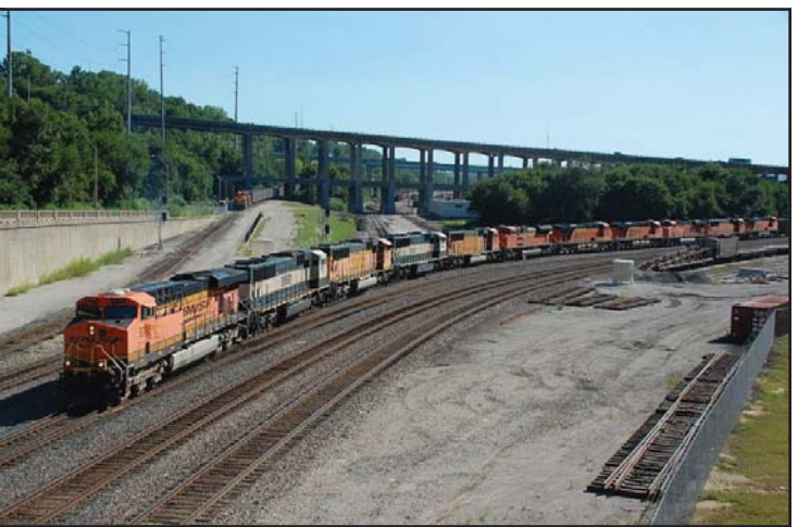
If the lashup on the left looks overpowered, how about the lashup on the right!