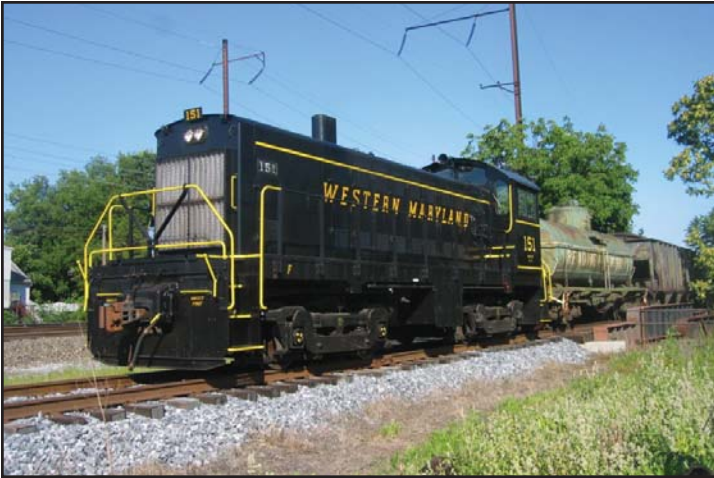
Old diesels never die... they just keep on working.