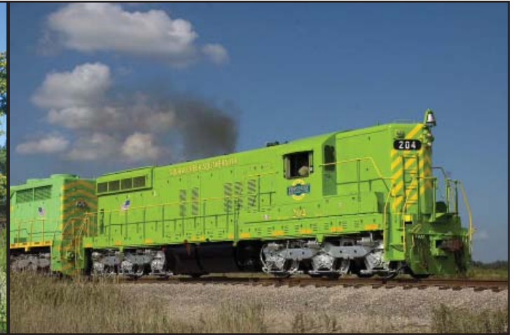
Squaw Creek Southern likes a bright color.