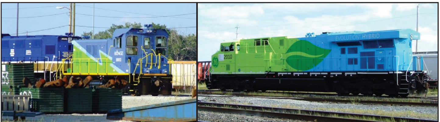
The Power of the Future - CSX NREX 2020 (far left and partially hidden) and Bunge 8002 in the UP yard at Dolton, IL. On the right, the GECX 2010 in Barr Yard. The 8002 is a model 1GS7B, the first NRE single engine gen-set built on a used EMD SW type frame and trucks.

Contact Ed Juairé at 706-935-5605 or anemrr@ejpj.com no later than November 30 with your reservation.